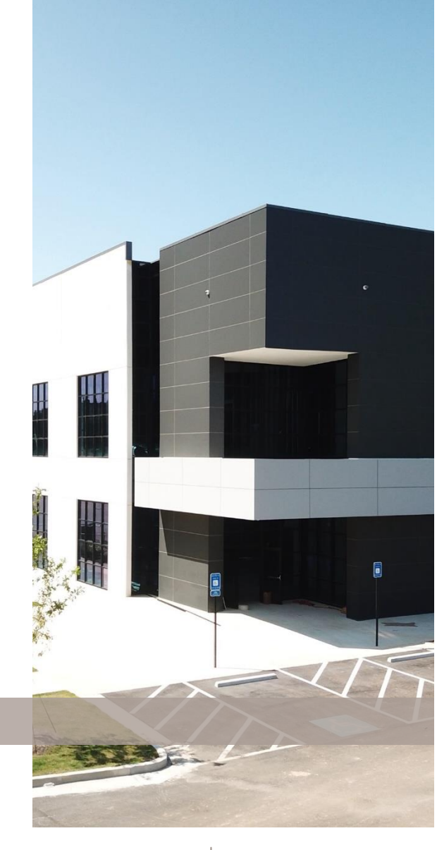
ROBINSON | WEEKS